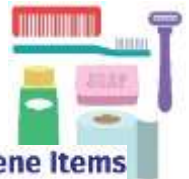
Donate Hygiene Items

These hygiene items are collected in the West entryway.