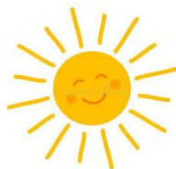
Church Office Manager