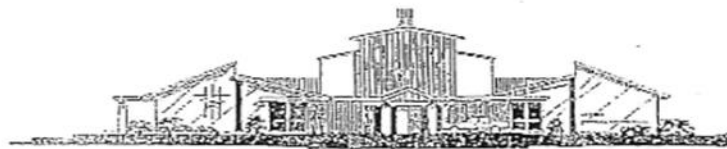
ST. LUKE LUTHERAN CHURCH