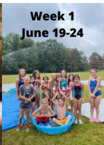
Day Camp, TNT (Traditional and New Things) and X-Teen