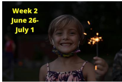
Night Owl, Mini Juniors, and Central PA Cycle

The first Kars for Kamp Car Show will be held at Camp Mt. Luther on June 11, 2022, from 9 a.m. to 3 p.m. All cars, street rods, trucks, jeeps and bikes are welcome. $15 fee for Pre-entry by 6/5/22 includes a food ticket. To register,