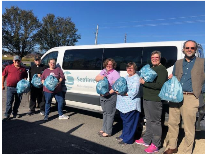
Those who helped pack the van with Seafarer Bags this year.

In total, 733 bags were picked up from the synod office on November 10 by Seafarers International. This year marked the tenth anniversary of our first collection and in those years, the synod has donated 6,309 bags.